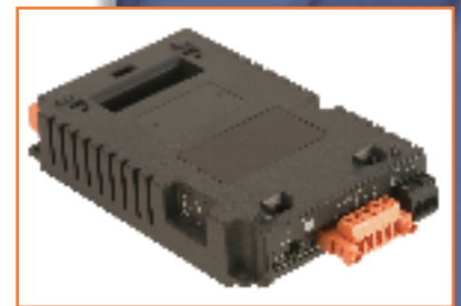
Optional BP43 Backpack includes HSC/PWM