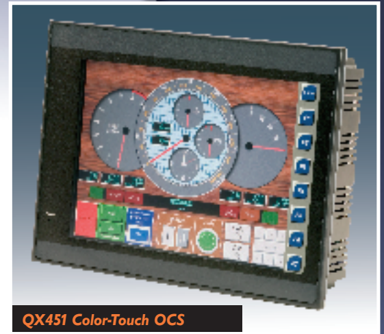
QX451 Color-Touch OCS

The advanced feature of video input functionality (VIM400) for the QX Color-Touch OCS is being used more and more by companies who need to integrate security, view machinery in remote locations, or need to incorporate a machine vision monitor with their control system. The video input option allows four channels of NTSC or PAL video to be connected to the QX (QX451, QX551, QX651) to provide video viewing and capture capability. Users can view video with the full frame rate at VGA resolution. Video can also be viewed freeze frame, and/or saved as a single frame to CompactFLASH. A separate control register allows the controller to automatically freeze or save video snap-shots based on the machine state.